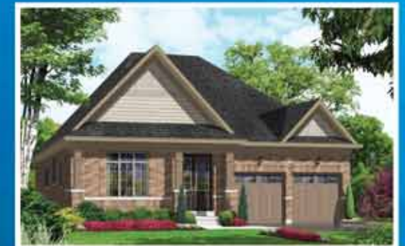
ELEV - B - 2546 sq.ft.