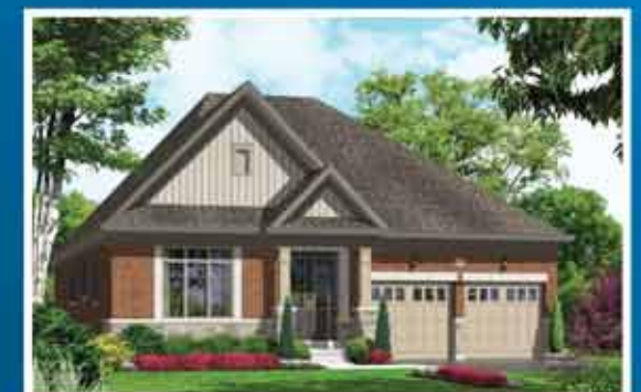
ELEV - C - 2546 sq.ft.