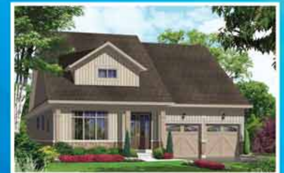
ELEV - A - 2546 sq.ft.