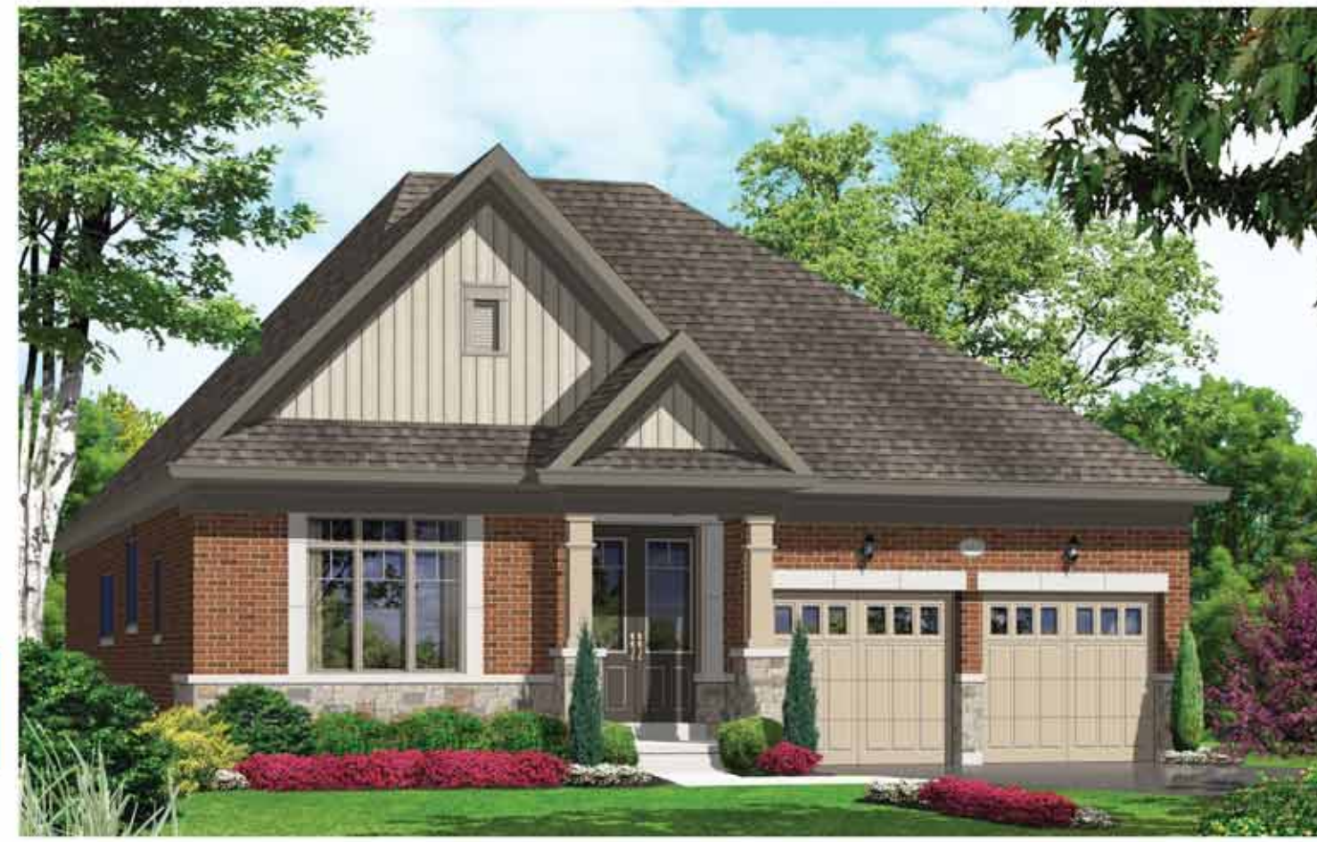
Elevation - C - 2546 sq.ft.