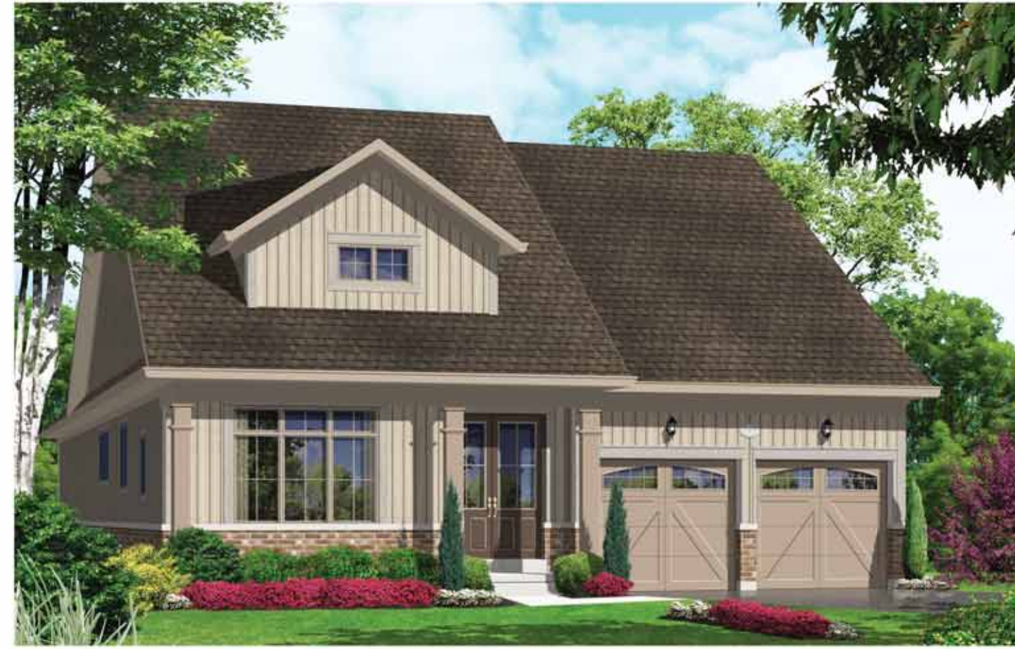
Elevation - A - 2546 sq.ft.