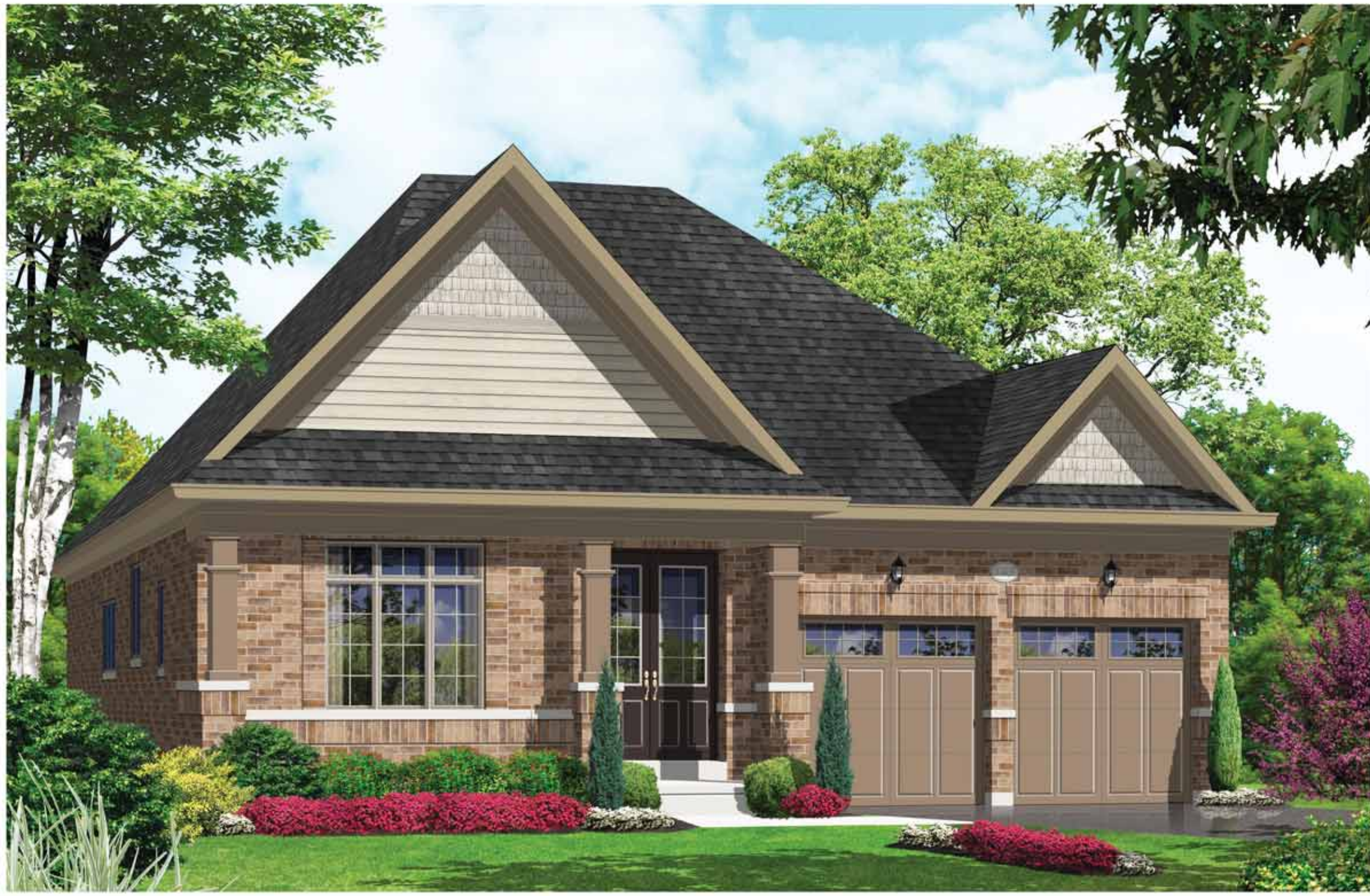
Elevation - B - 2546 sq.ft.