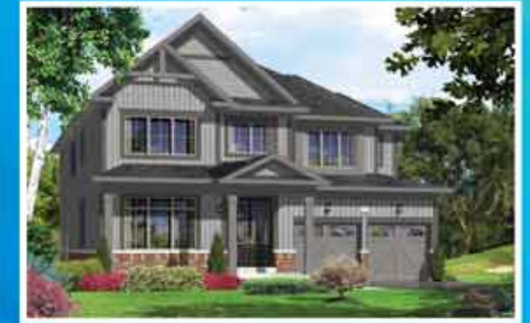
ELEV - A - 3089 sq.ft.