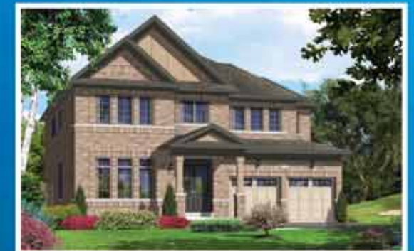
ELEV - B - 3155 sq.ft.