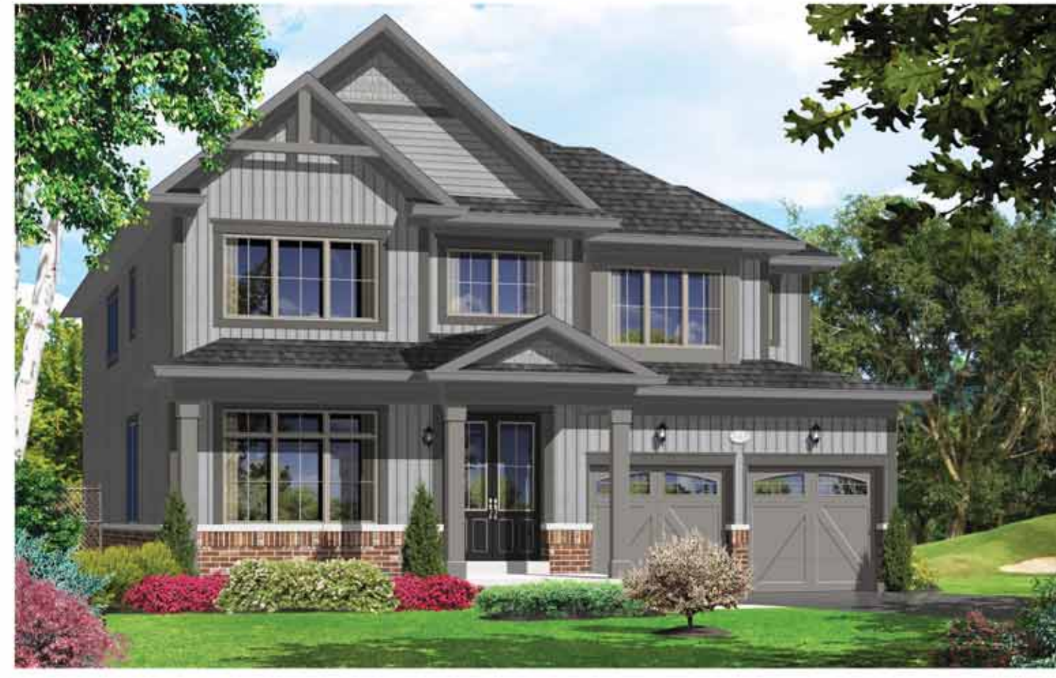
Elevation - A - 3089 sq.ft.