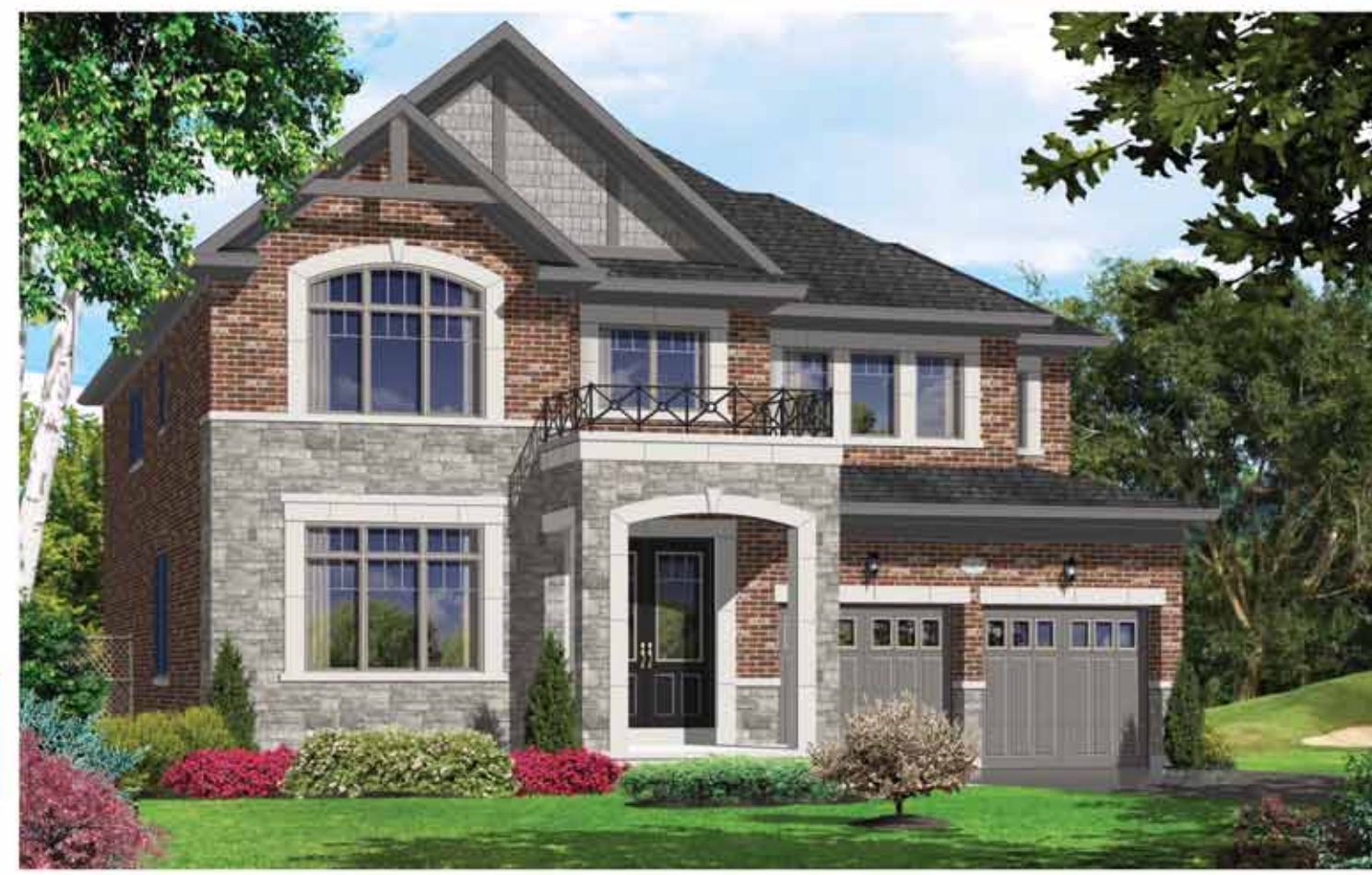
Elevation - C - 3155 sq.ft.