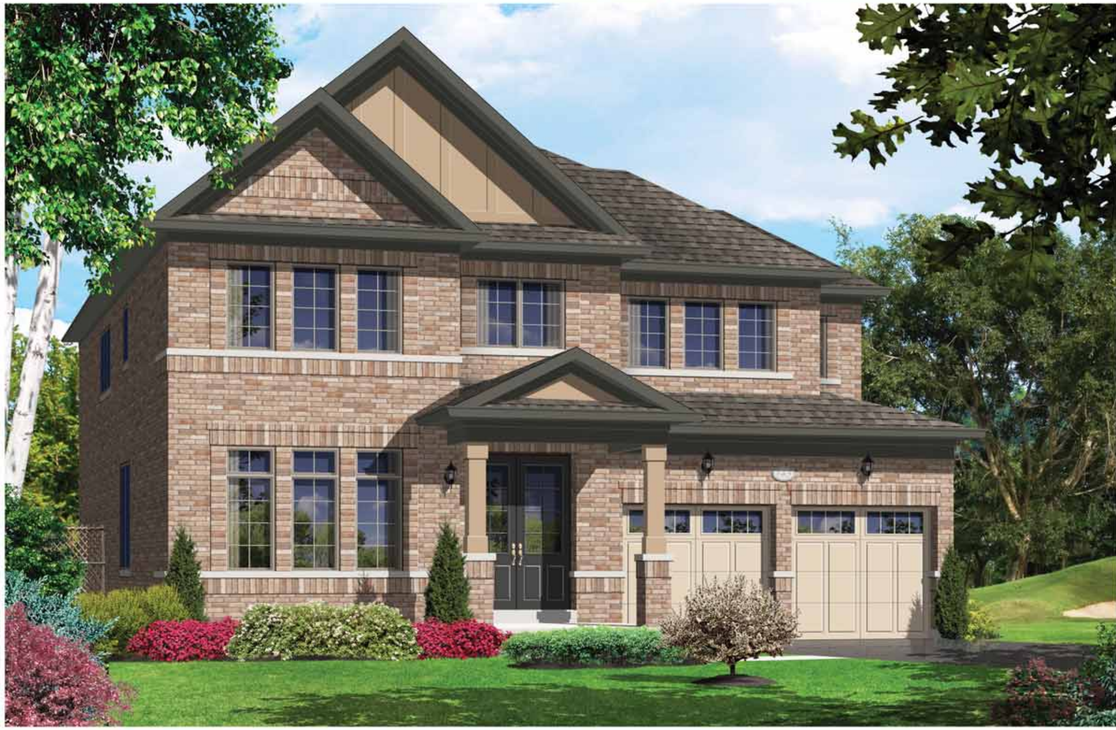
Elevation - B - 3155 sq.ft.