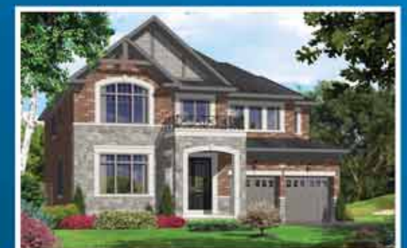
ELEV - C - 3155 sq.ft.