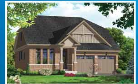
ELEV - B - 2040 sq.ft.