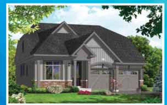
ELEV - A - 2040 sq.ft.