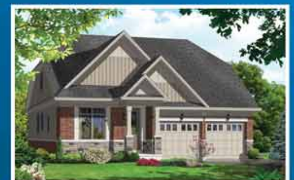
ELEV - C - 2040 sq.ft.