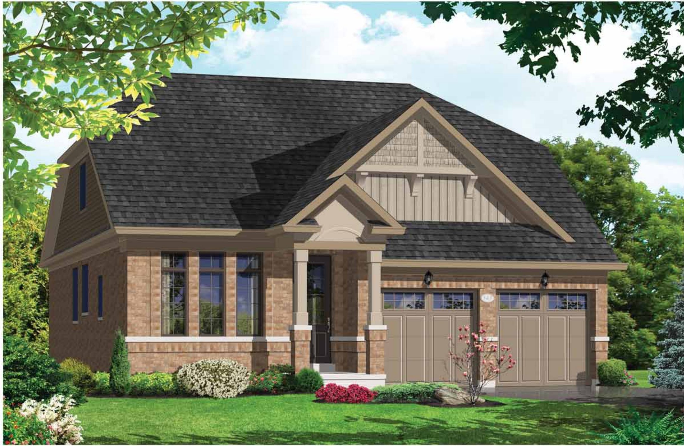
Elevation - B - 2040 sq.ft.