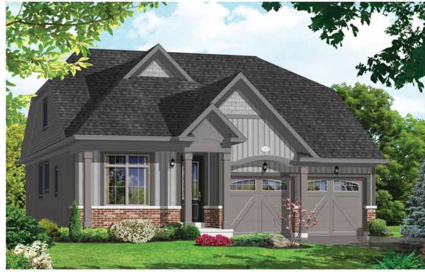
Elevation - A - 2040 sq.ft.