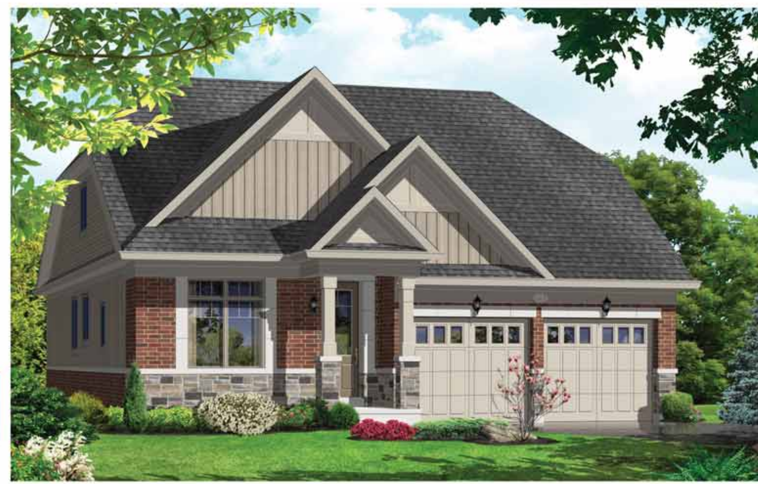
Elevation - C - 2040 sq.ft.

All illustrations are artist's concept. E.&O.E.