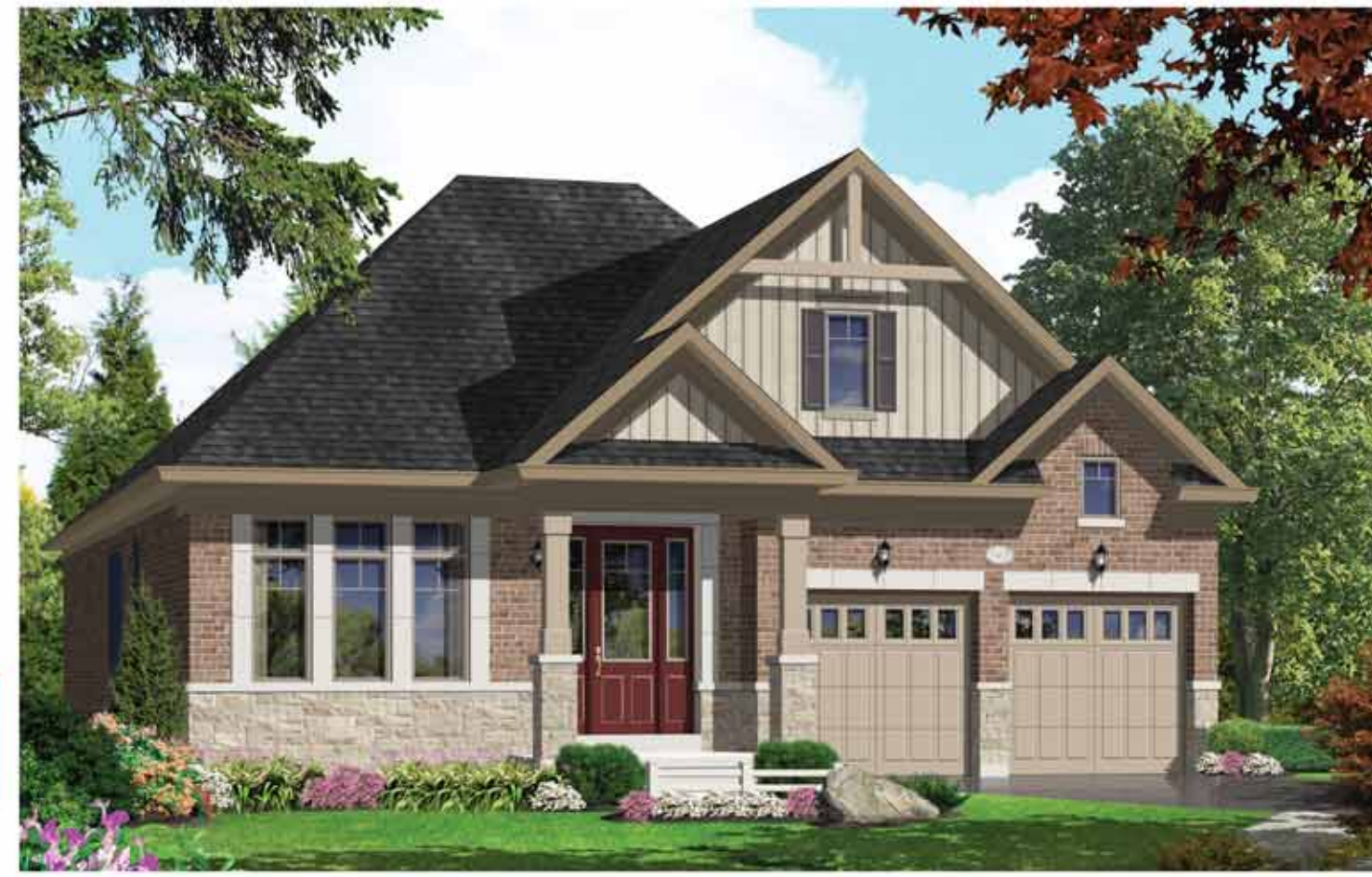
Elevation - C - 2328 sq.ft.

All illustrations are artist's concept. E.&O.E.