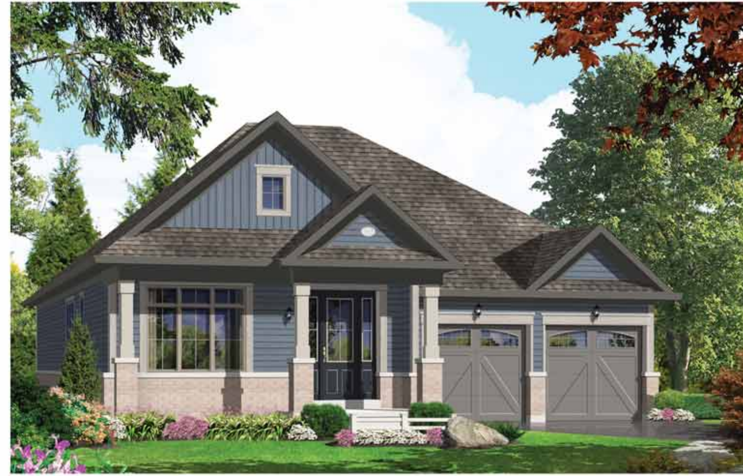
Elevation - A - 2328 sq.ft.