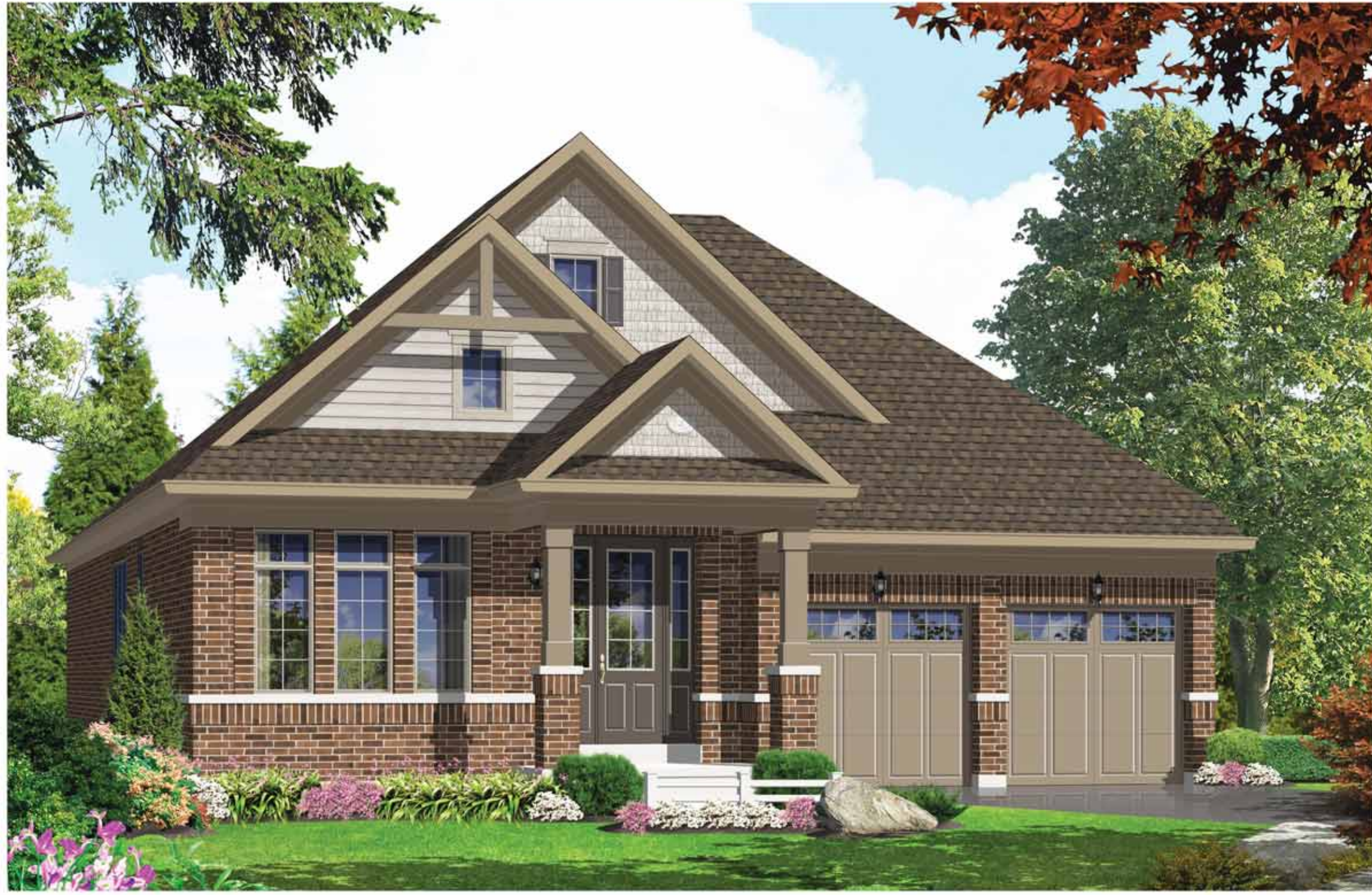
Elevation - B - 2328 sq.ft.