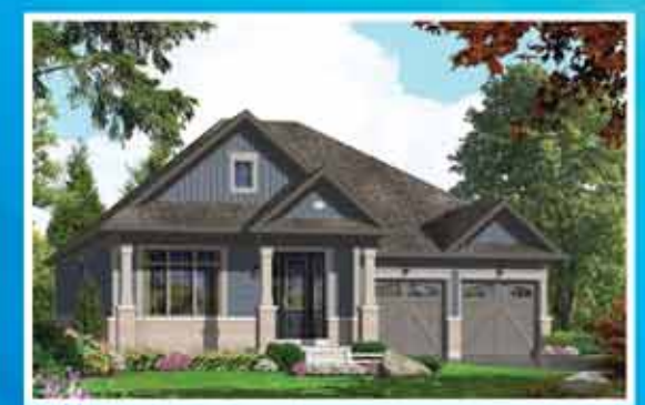
ELEV - A - 2328 sq.ft.