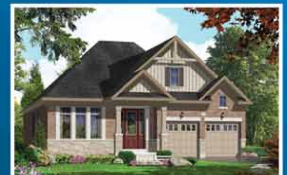
ELEV - C - 2328 sq.ft.