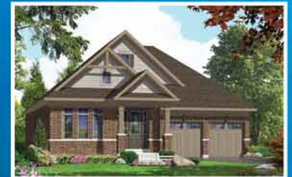
ELEV - B - 2328 sq.ft.