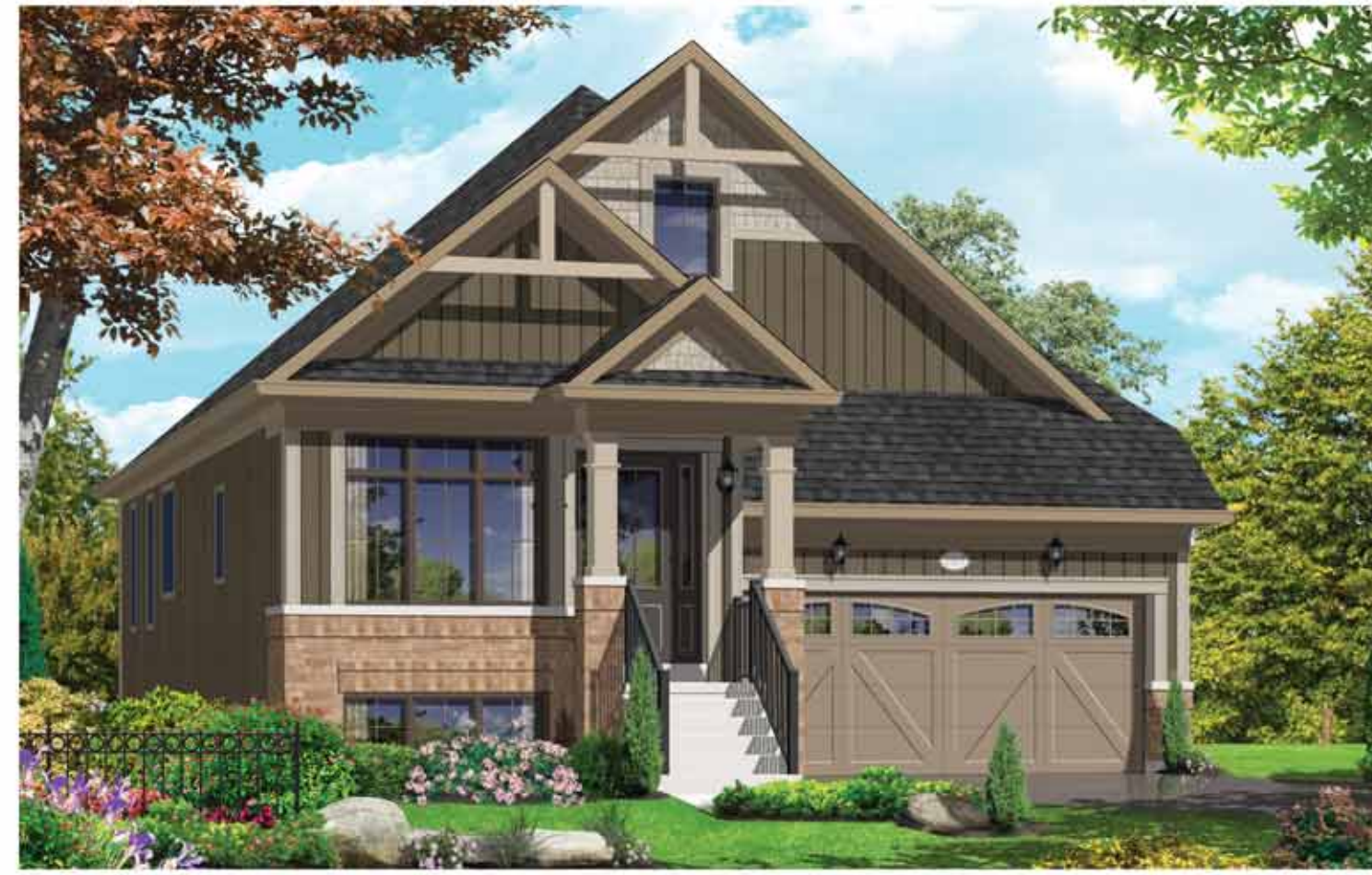
Elevation - A - 1851 sq.ft.