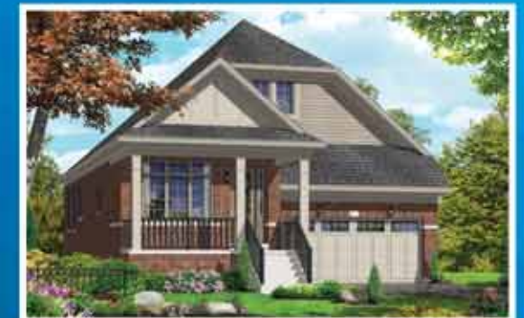
ELEV - B - 1851 sq.ft.