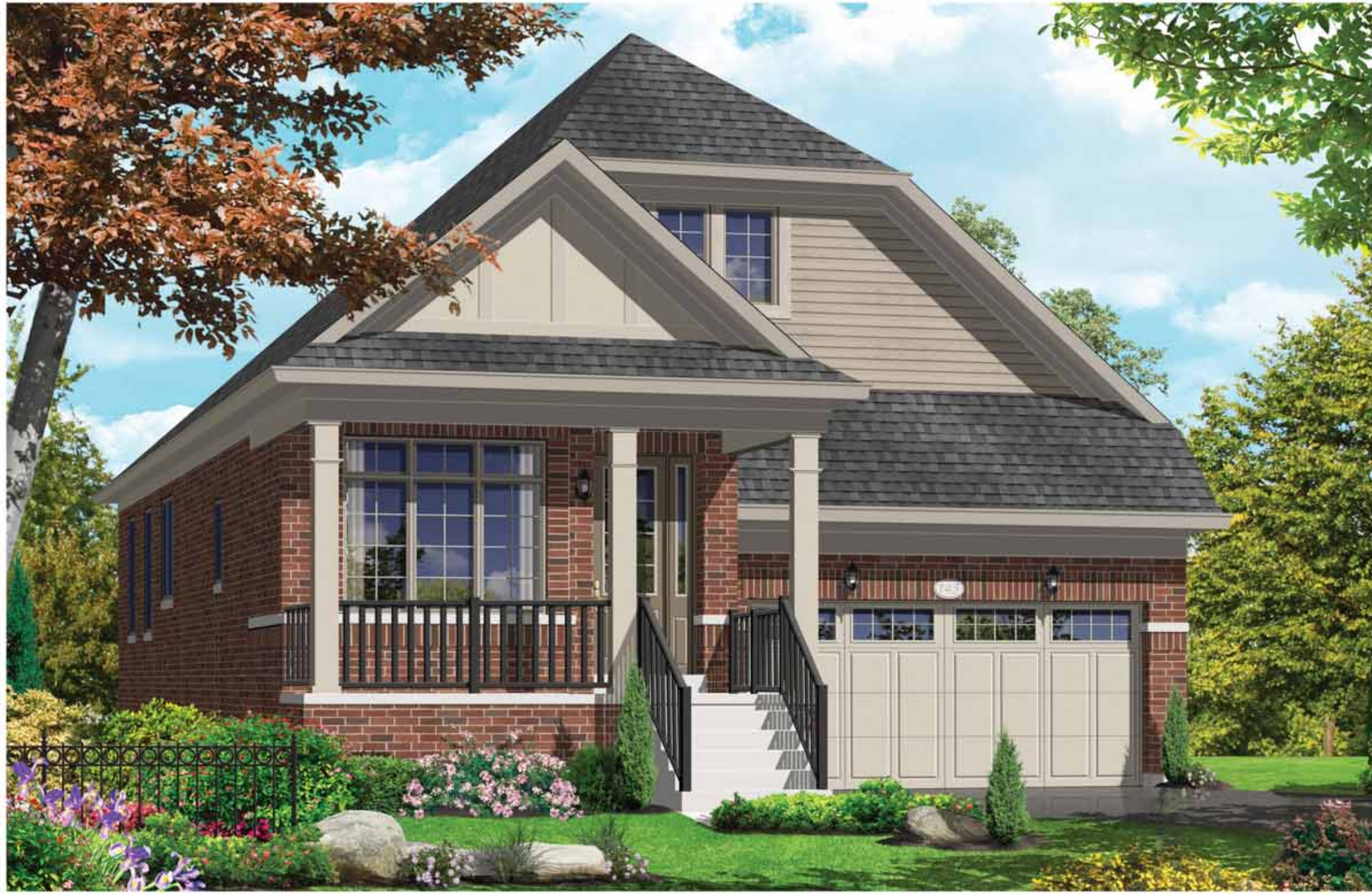
Elevation - B - 1851 sq.ft.