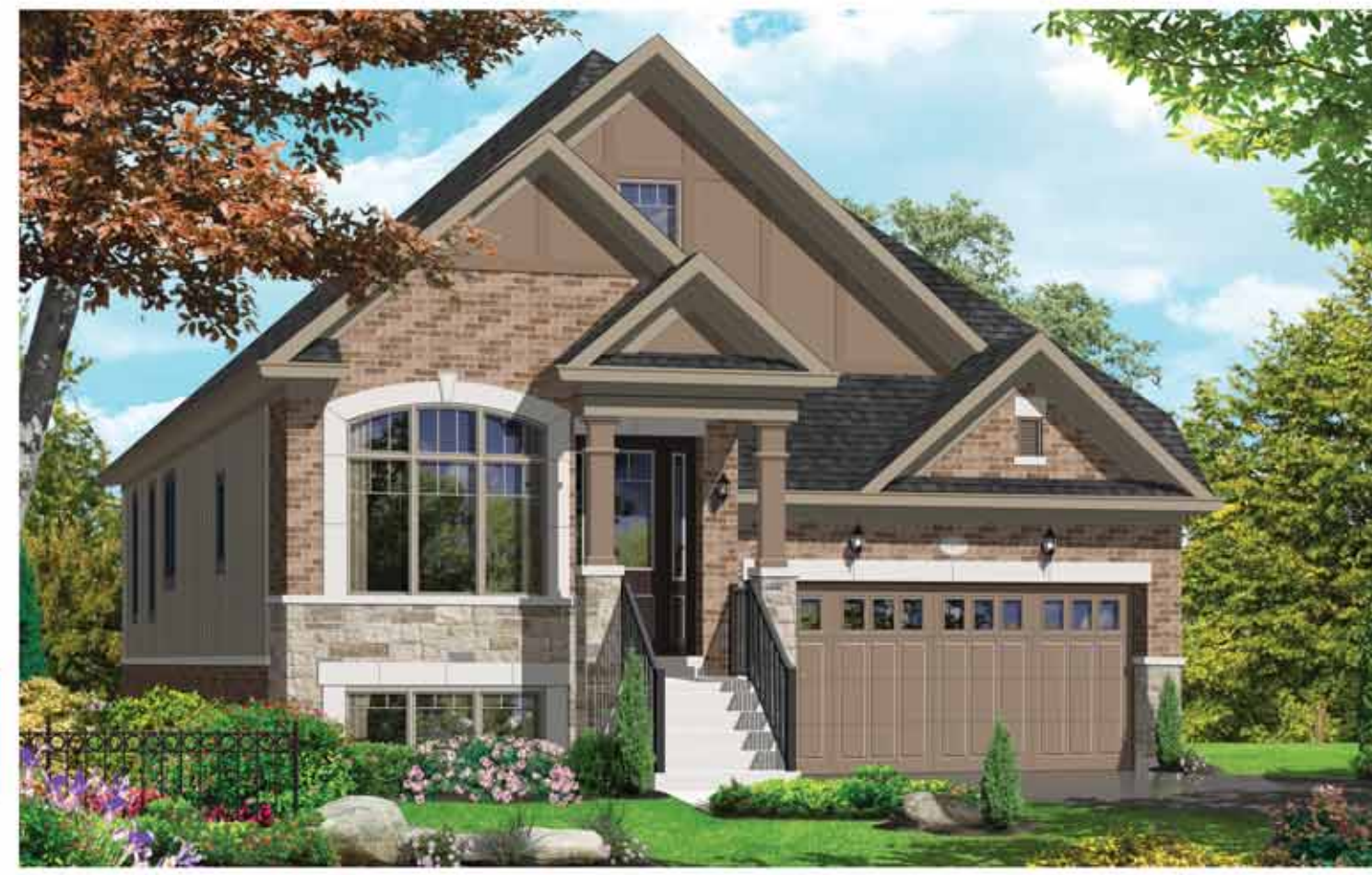
Elevation - C - 1851 sq.ft.