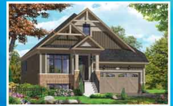
ELEV - A - 1851 sq.ft.