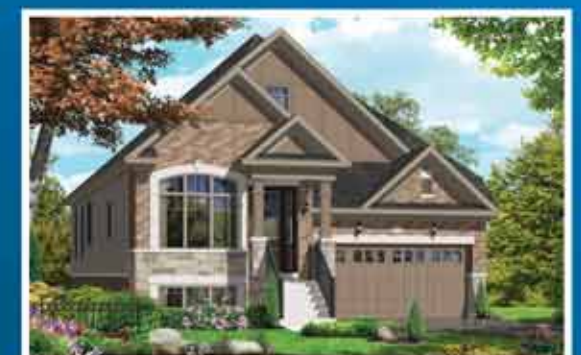
ELEV - C - 1851 sq.ft.