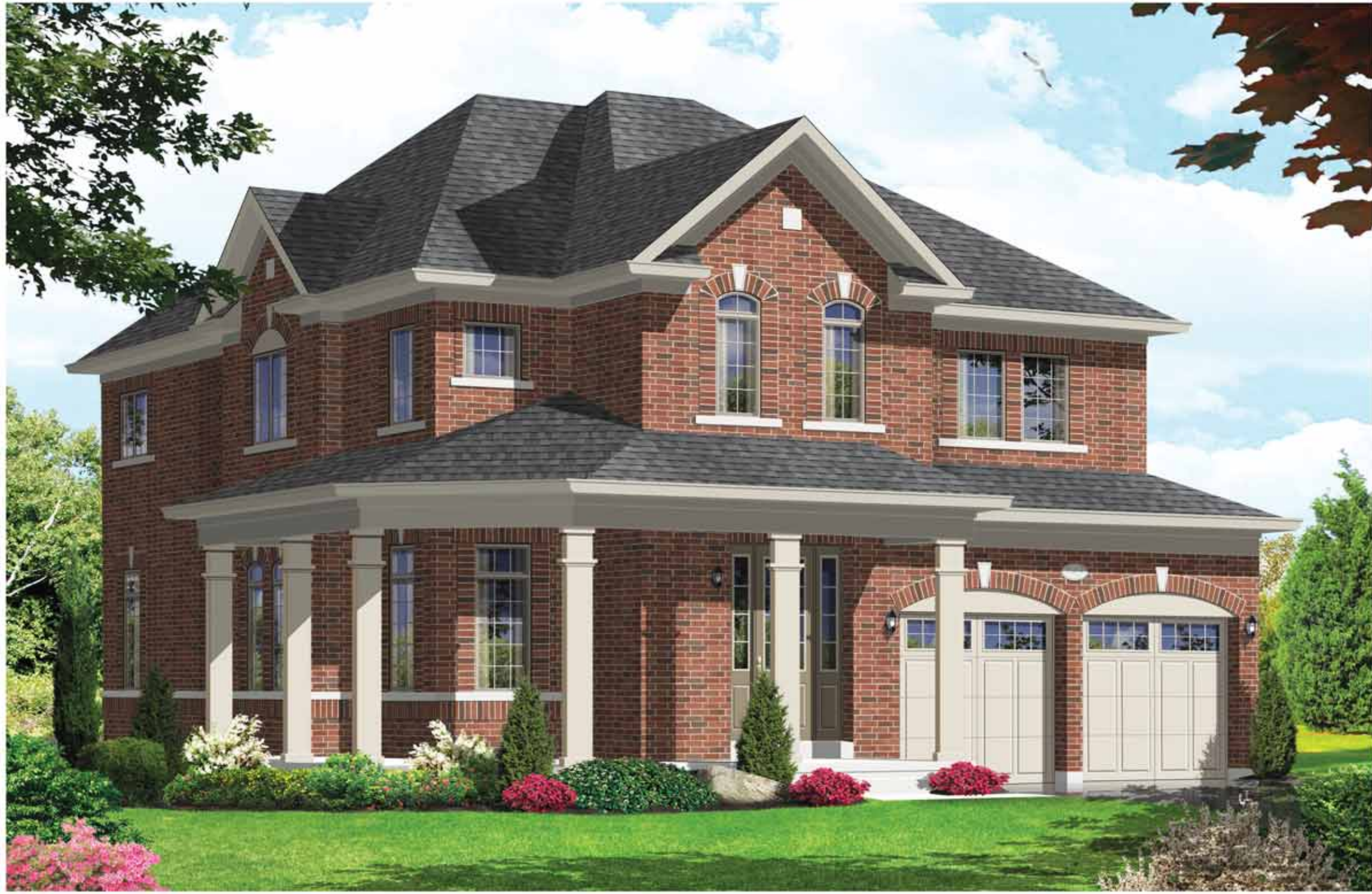
Elevation - B - 2495 sq.ft.