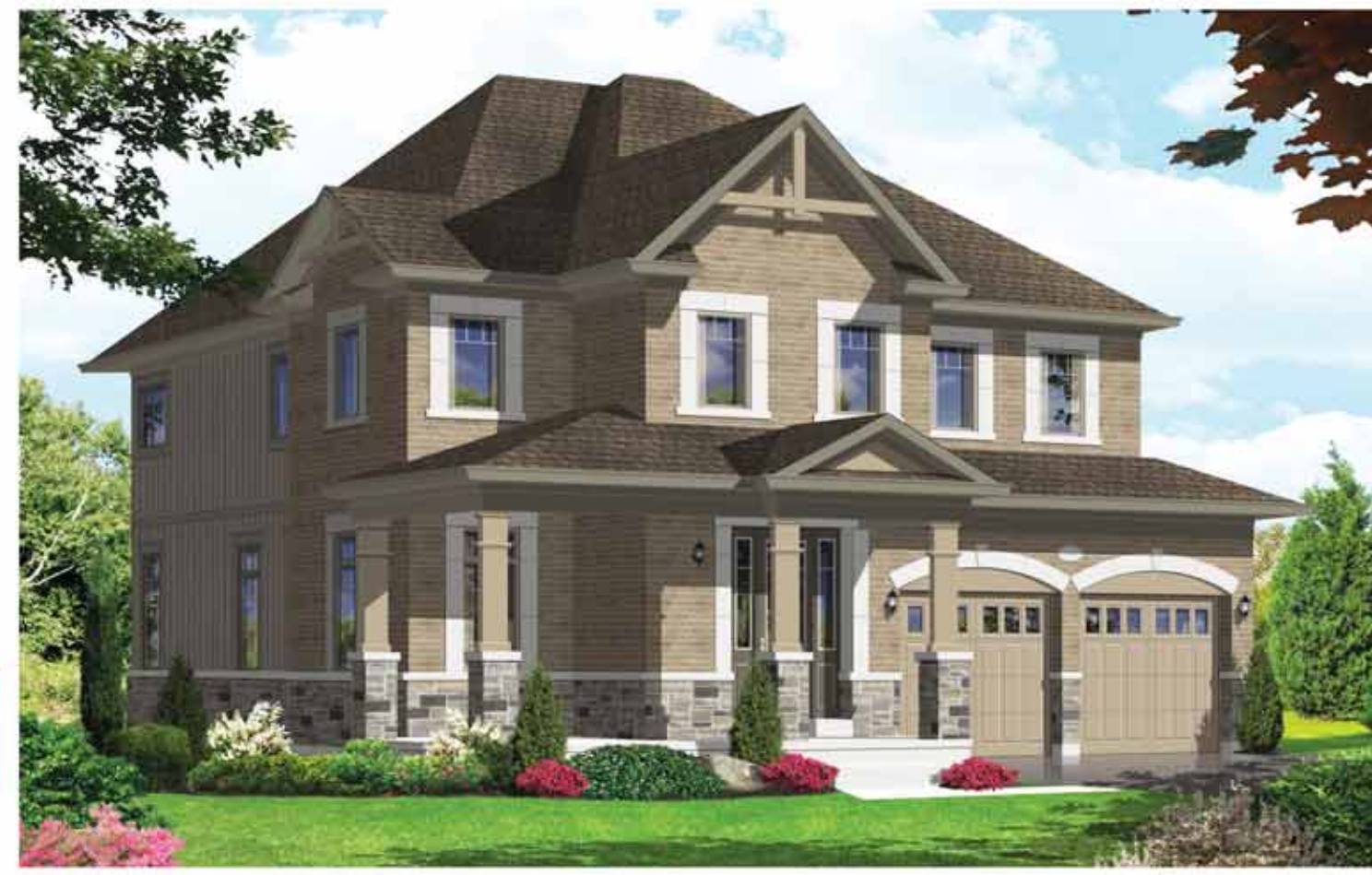
Elevation - C - 2510 sq.ft.