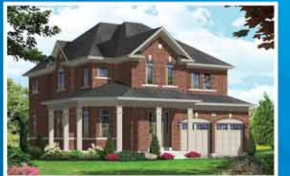
ELEV - B - 2495 sq.ft.