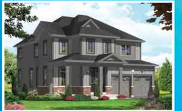
ELEV - A - 2515 sq.ft.