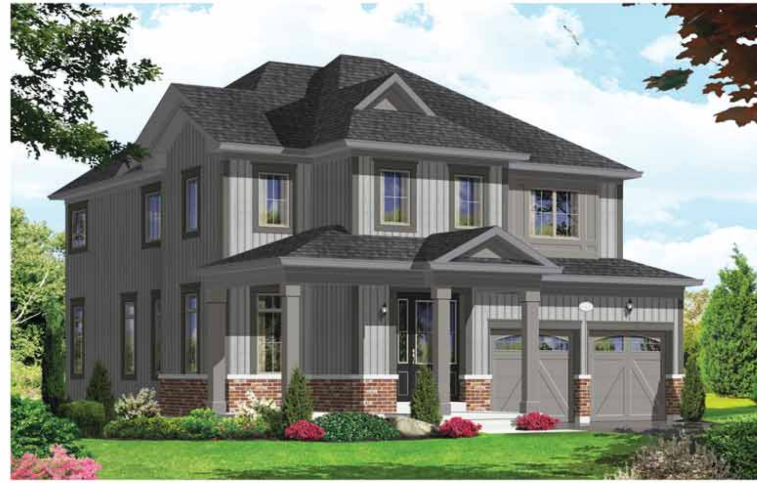
Elevation - A - 2515 sq.ft.