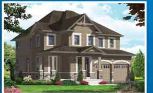
ELEV - C - 2510 sq.ft.