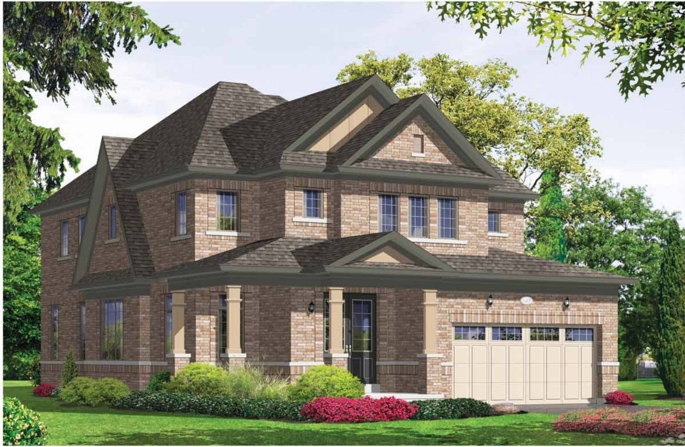
Elevation - B - 2702 sq.ft.