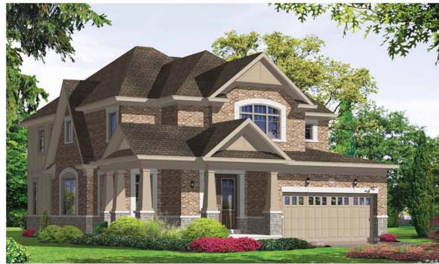
Elevation - C - 2706 sq.ft.