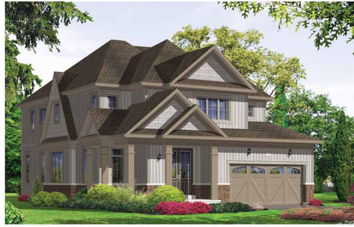
Elevation - A - 2705 sq.ft.