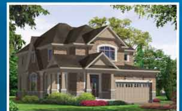
ELEV - C - 2706 sq.ft.