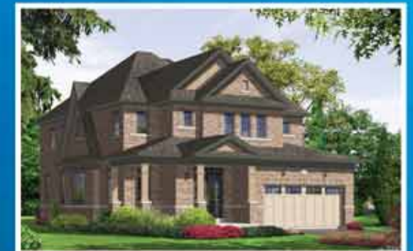
ELEV - B - 2702 sq.ft.