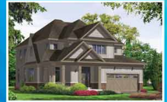
ELEV - A - 2705 sq.ft.