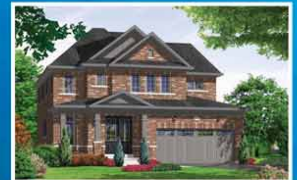
ELEV - B - 2688 sq.ft.