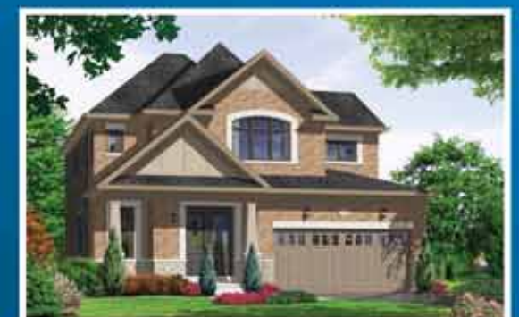
ELEV - C - 2645 sq.ft.