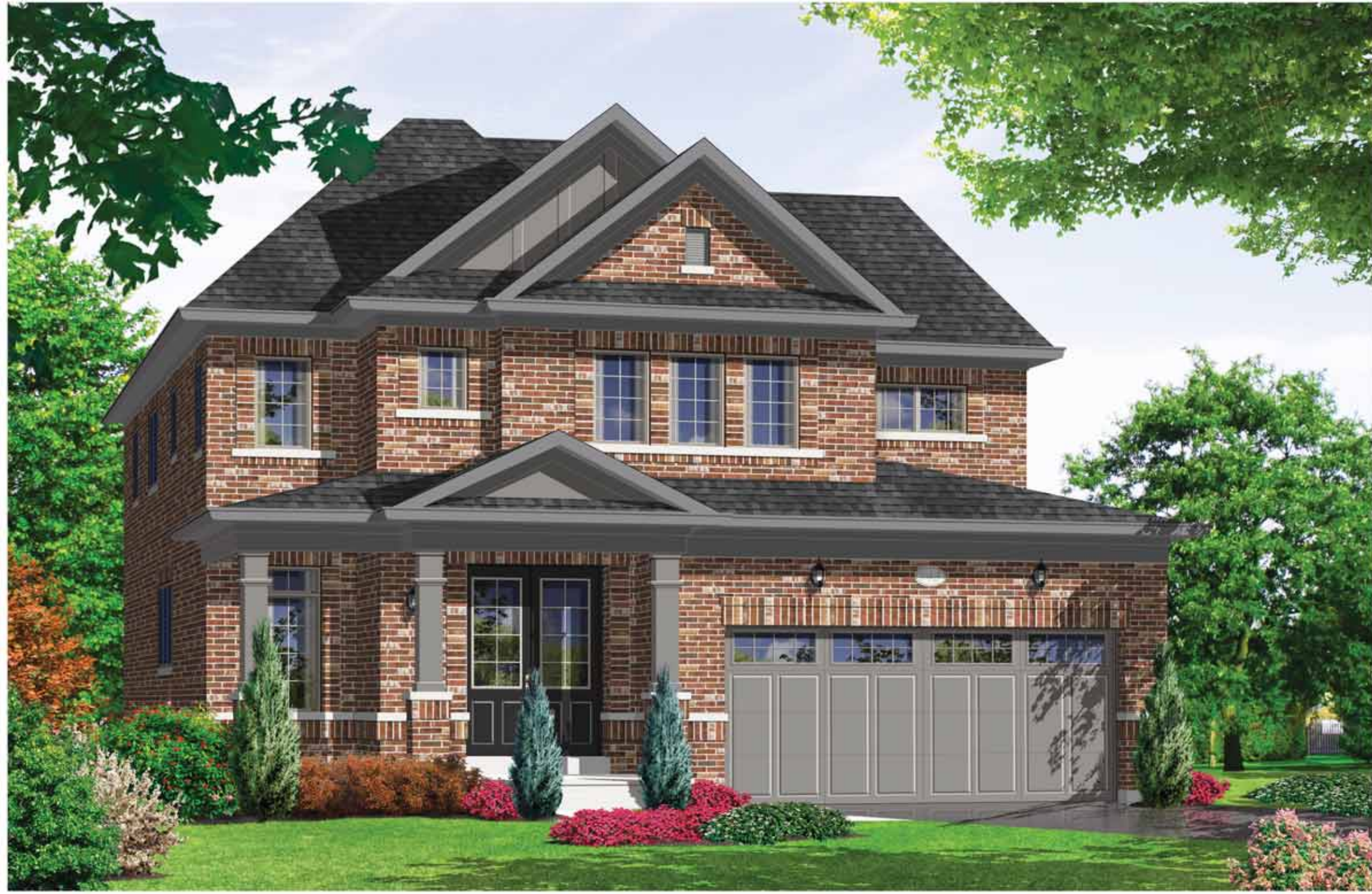
Elevation - B - 2688 sq.ft.