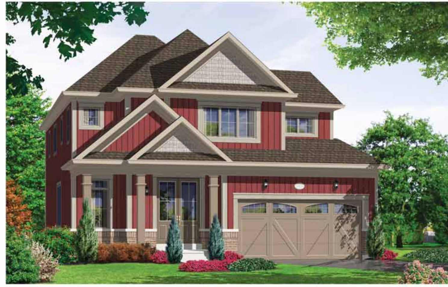
Elevation - A - 2688 sq.ft.