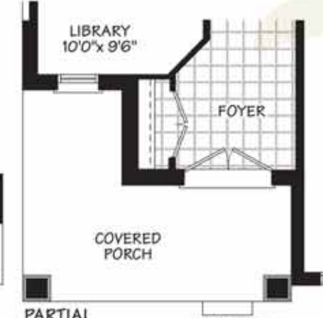
PARTIAL ELEV - B