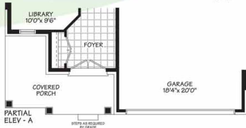
PARTIAL ELEV - A