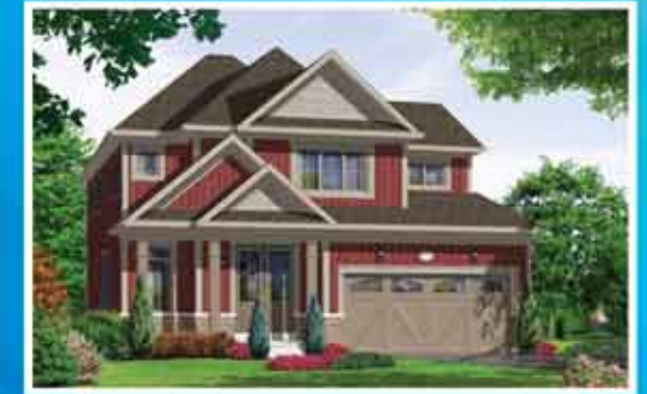
ELEV - A - 2688 sq.ft.