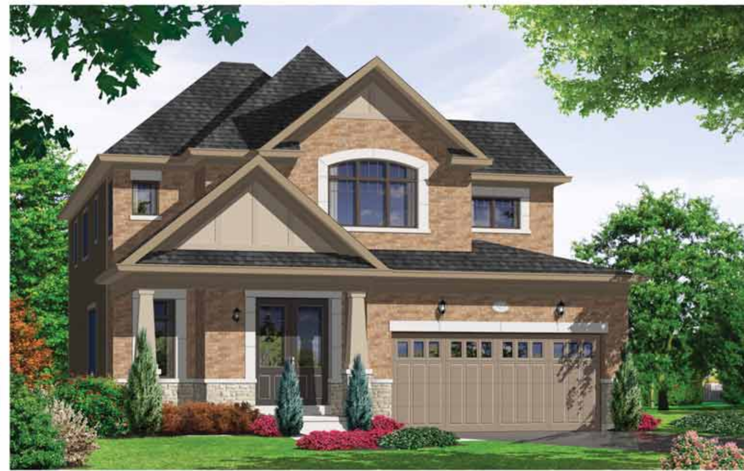
Elevation - C - 2645 sq.ft.