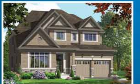
ELEV - C - 3409 sq.ft.