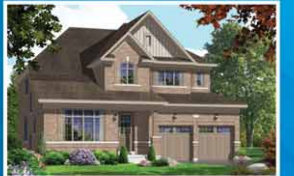
ELEV - B - 3409 sq.ft.