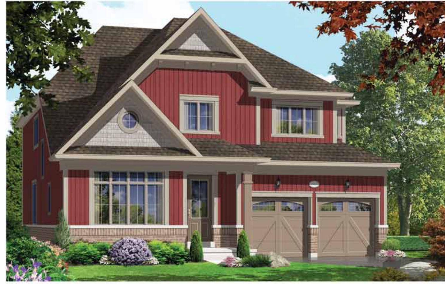
Elevation - A - 3354 sq.ft.