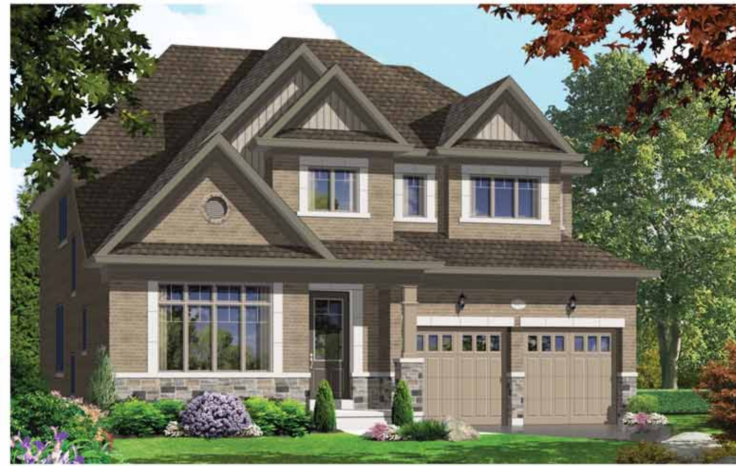
Elevation - C - 3409 sq.ft.

All illustrations are artist's concept. E.&O.E.