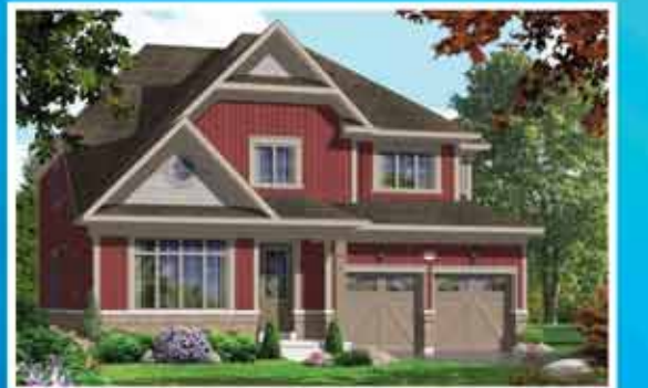
ELEV - A - 3354 sq.ft.