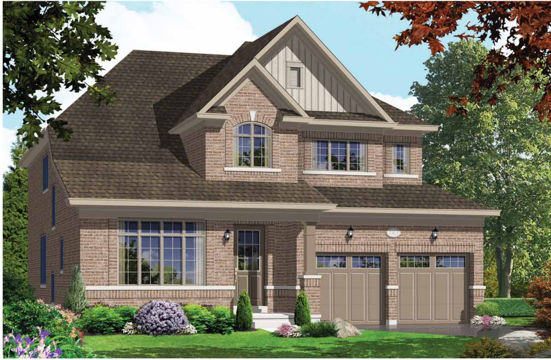
Elevation - B - 3409 sq.ft.