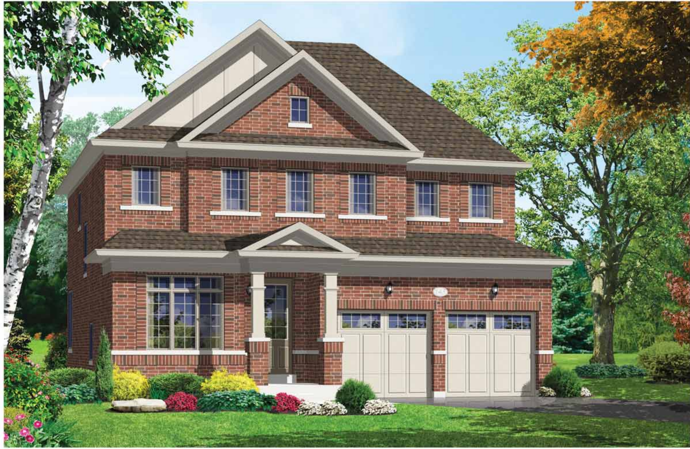
Elevation - B - 2877 sq.ft.