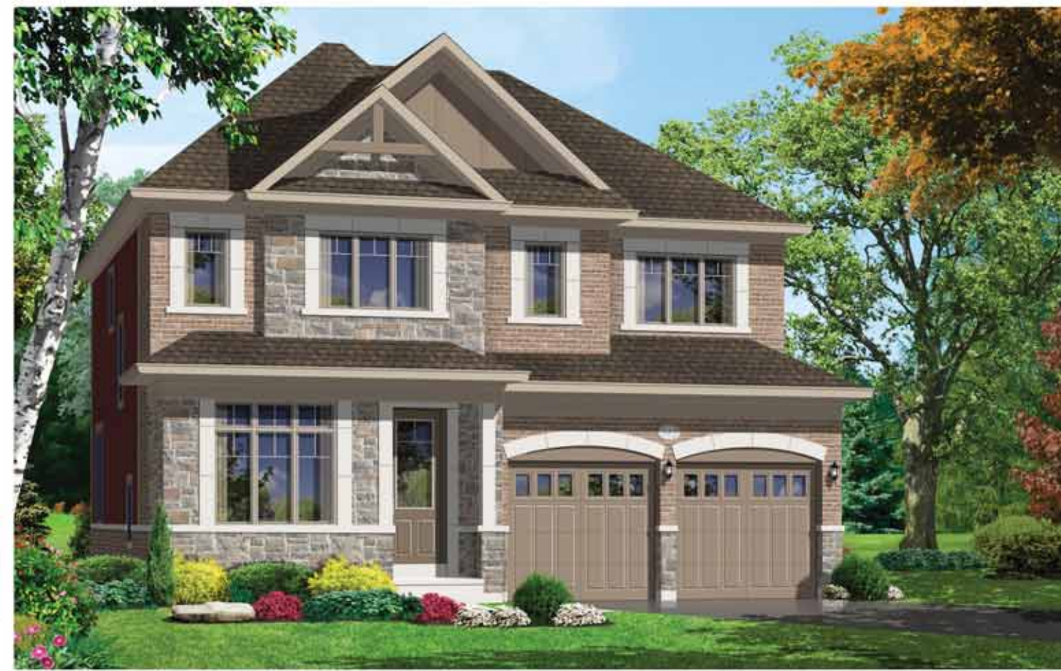
Elevation - C - 2831 sq.ft.