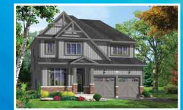
ELEV - A - 2877 sq.ft.