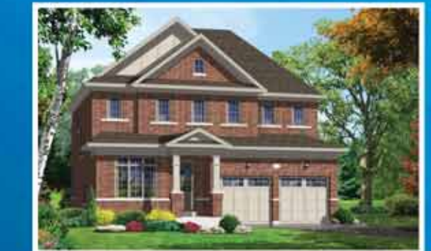
ELEV - B - 2887 sq.ft.