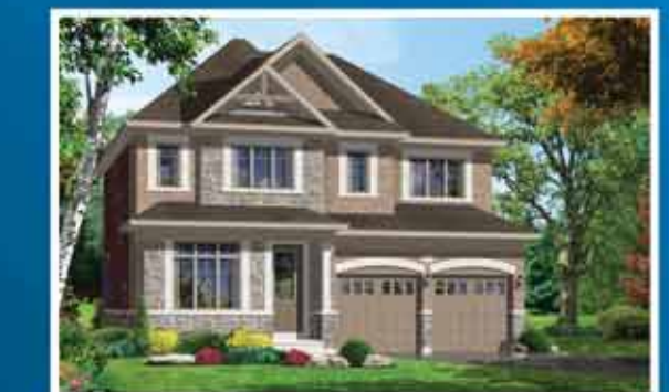
ELEV - C - 2831 sq.ft.