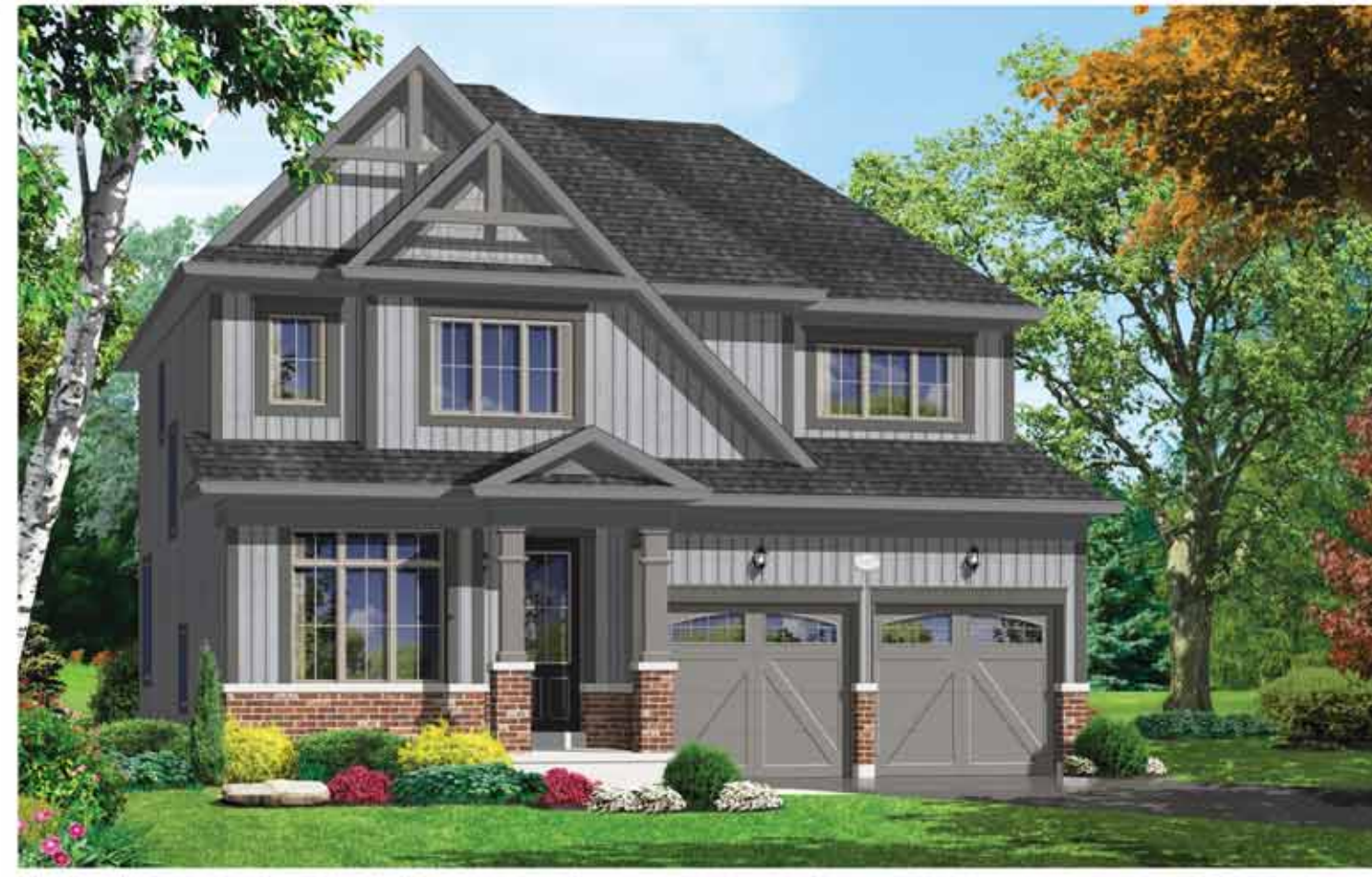
Elevation - A - 2887 sq.ft.